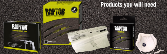
Products you will need