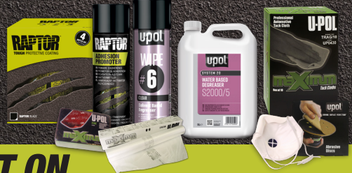
Products you will need