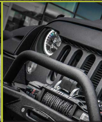
Jeep and 4x4 Accessories