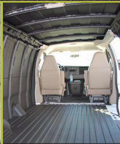
Vehicle Floors and Interiors