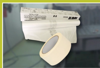
Masking is essential to eliminate the risk of overspray.