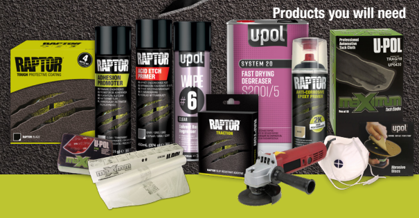
Products you will need