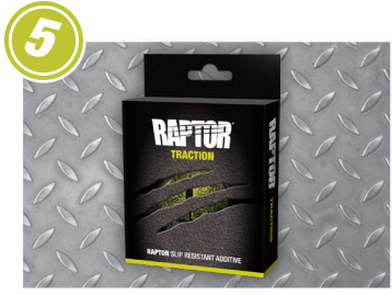
5 ADD ANTI-SLIP For an anti-slip coating, add one bag of RAPTOR Traction per bottle.