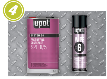
4 DEGREASE AGAIN Degrease the area with a solvent-based degreaser such as WIPE#6 or System 20.