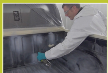
RAPTOR 2K Epoxy Primer in aerosol can be useful for smaller areas.