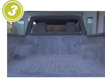
3 CLEAN Using compressed air, remove any excess dust.