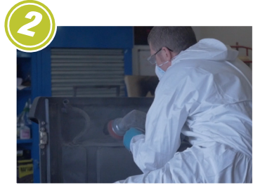
2 SAND Abrade the entire truck bed with 120-180 grit or a nylon cup brush.