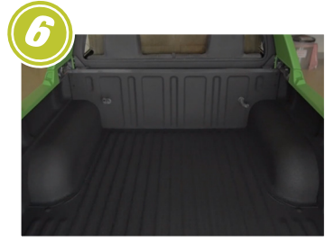
6 APPLY RAPTOR Directly apply RAPTOR.

NOTES: WE HAVE REMOVED THE PLASTIC BED LINER AS WATER SITS BETWEEN THE PLASTIC BED LINER AND THE BED AND CORRODES THE BODY WORK.