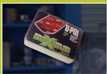
When complete, scuff any shiny area with a red scuff pad.