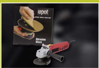
Grind or remove any rust with a coarse abrasive or a grinder.